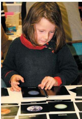
Learning about planets in the solar system